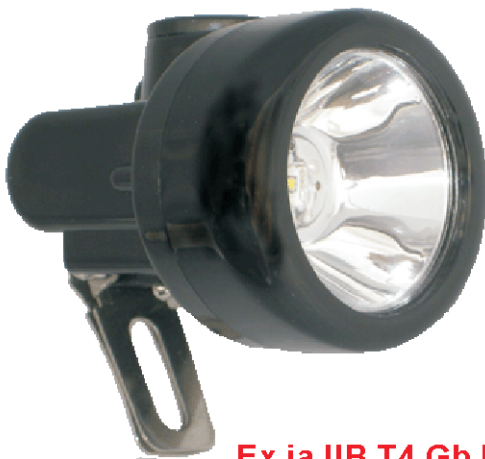
Ex ia IIB T4 Gb IP67

KH3E-Ex is our flagship model. It is the brightest in our Cordless Miner's Caplamp Series and is charged through external electrodes.