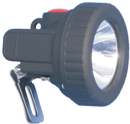
Ex ia IIB T4 Ga IP67

The KH3U-Ex is our flagship model. It is the brightest in our Cordless Miner's Caplamp Series and is charged through either charging electrodes or charging socket.